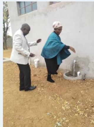
Water On Tap!