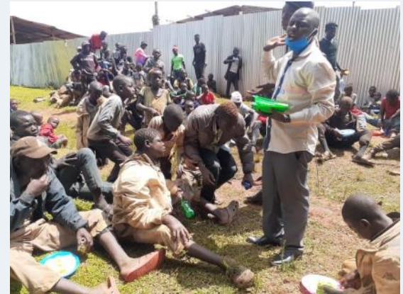
Getting Ready to Feed the Street Kids in Bungoma

Toilets —We are now re-focusing back on our major mission, which is to help the poor and disadvantaged become self-sufficient. Thanks to a generous donation we have been able to complete the building of a block of toilets at Nkulumane, in Bulawayo. Over the years we have worked with the Pentecostal Christian Church to establish a property in Nkulumane for its church to carry out its mission to some of the most needy people in the community. As well as being a place for the church to meet, this property operates as a community centre for the disabled, as a counselling centre, and a training and conference centre. Up until now there have been no onsite toilets for those who attend the centre. The only access to toilets has been because of the generosity of a few neighbors who have allowed their toilet facilities to be used. The toilets are presently being painted and will soon be operational and officially open for use.