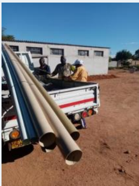
The structure is finished and the plumbers and plumbing supplies arrive