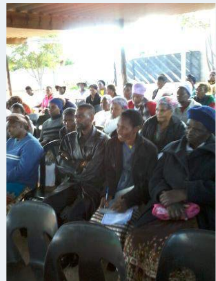
ABC Training Session