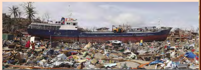
After Typhoon Yolanda hit Tacloban

For your interest , during October of last year $1100 was given through Liberty World Missions to help with the Philippines' disasters. This was mainly used for kitchen utensils; common nails, hammer and other carpentry tools for making temporary shelter; fresh foods; kerosene fuel for temporary lighting and LPG gas for cooking. Thanks to those who gave.