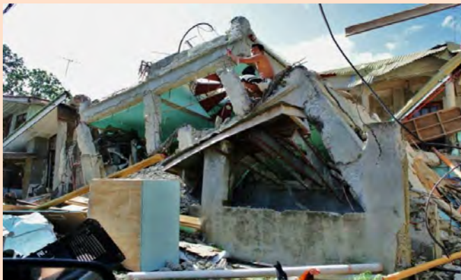
After the Earthquake on Bohol Island