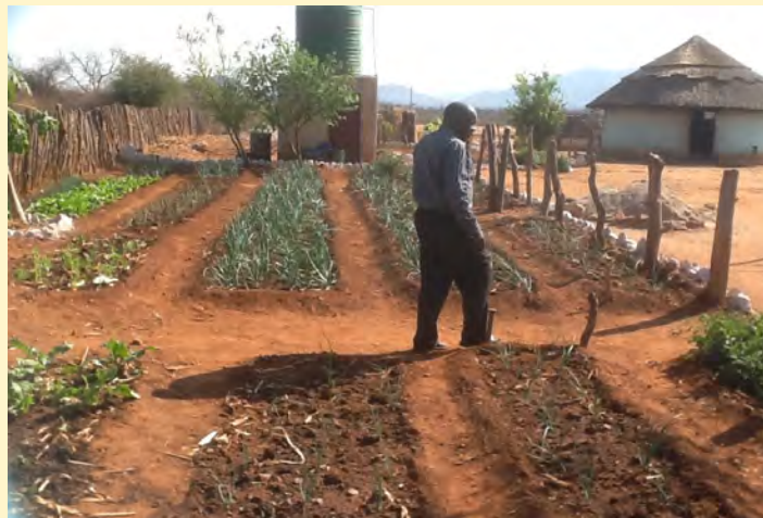
Insiza Children's Farm